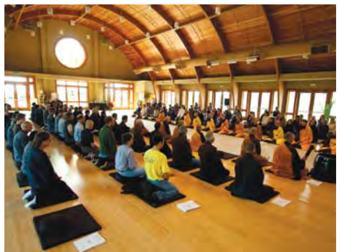
The meditation hall at Deer Park monastery in Escondido, California.